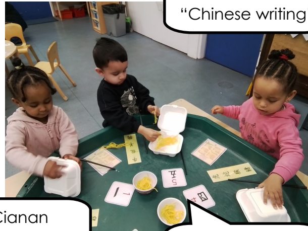
Hiyab "Chinese writing"