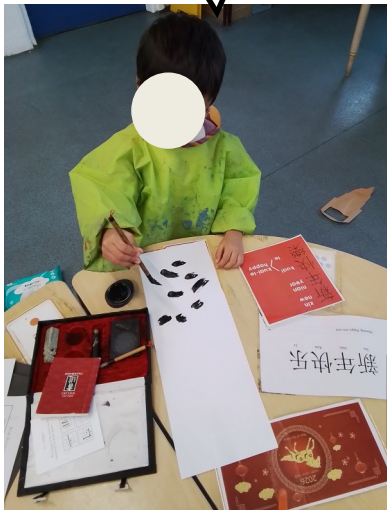
Samar "Chinese New"